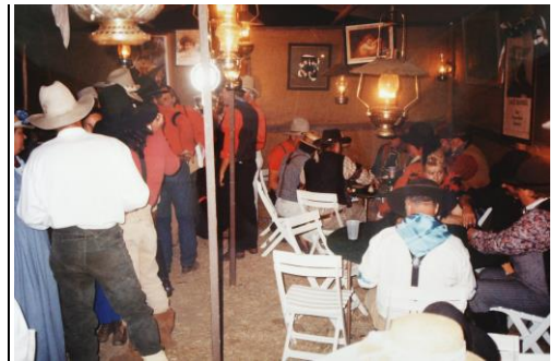
Gouge Eye just before the ladies arrived.

The three ladies were Ready & Able Annie, Querida, Slo Mo Steph and Aurora Borealice and they were not to be trifled with and their intentions were clear – to run the town of Coyote Valley. After the smoke clear the three cowgirls had dominated the shooting and finished in the top three.