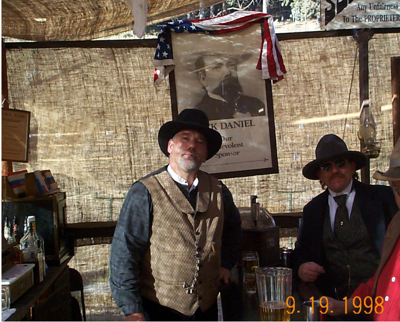
Two unsavory gents at the bar.