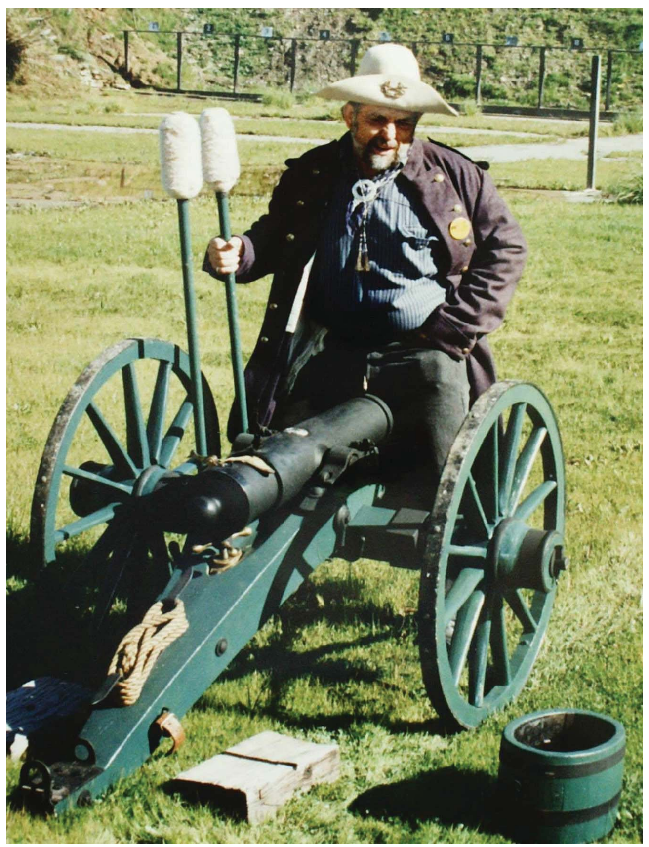
Figure 3: Long Horn cannon training seminar - interesting techniques.