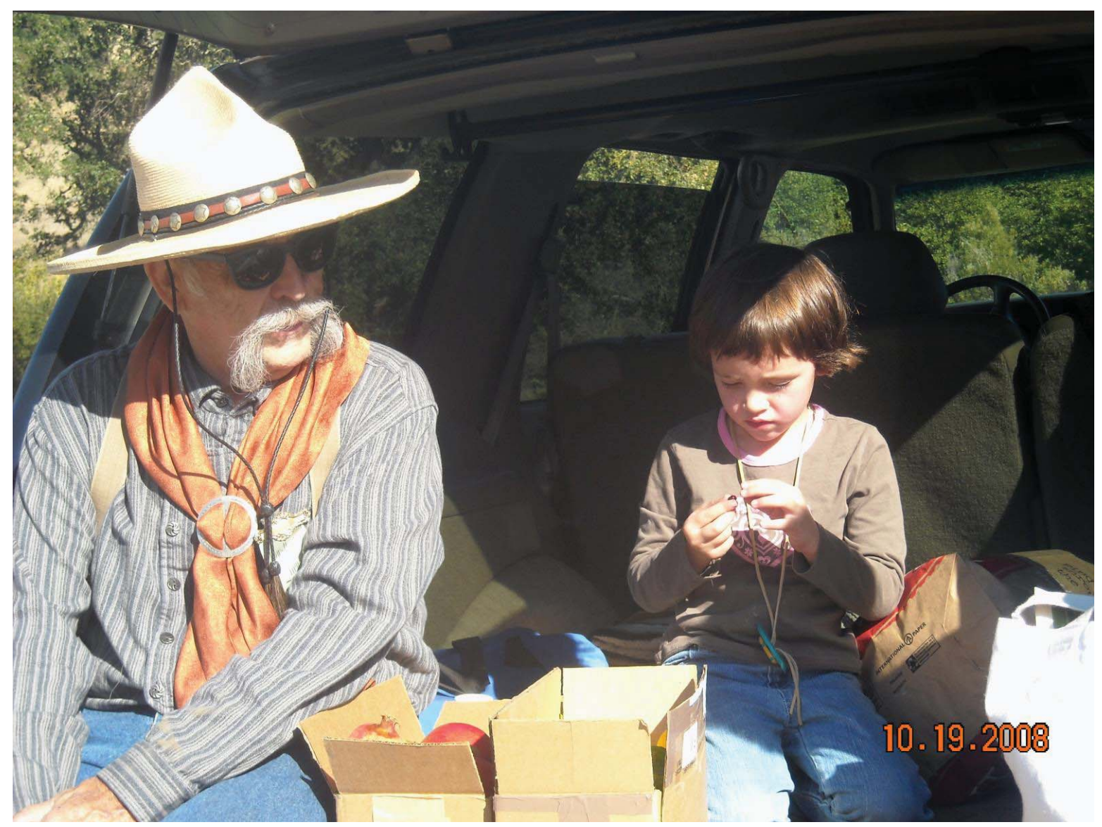
Figure 4: Listen to your dad, you can't date until your 35.