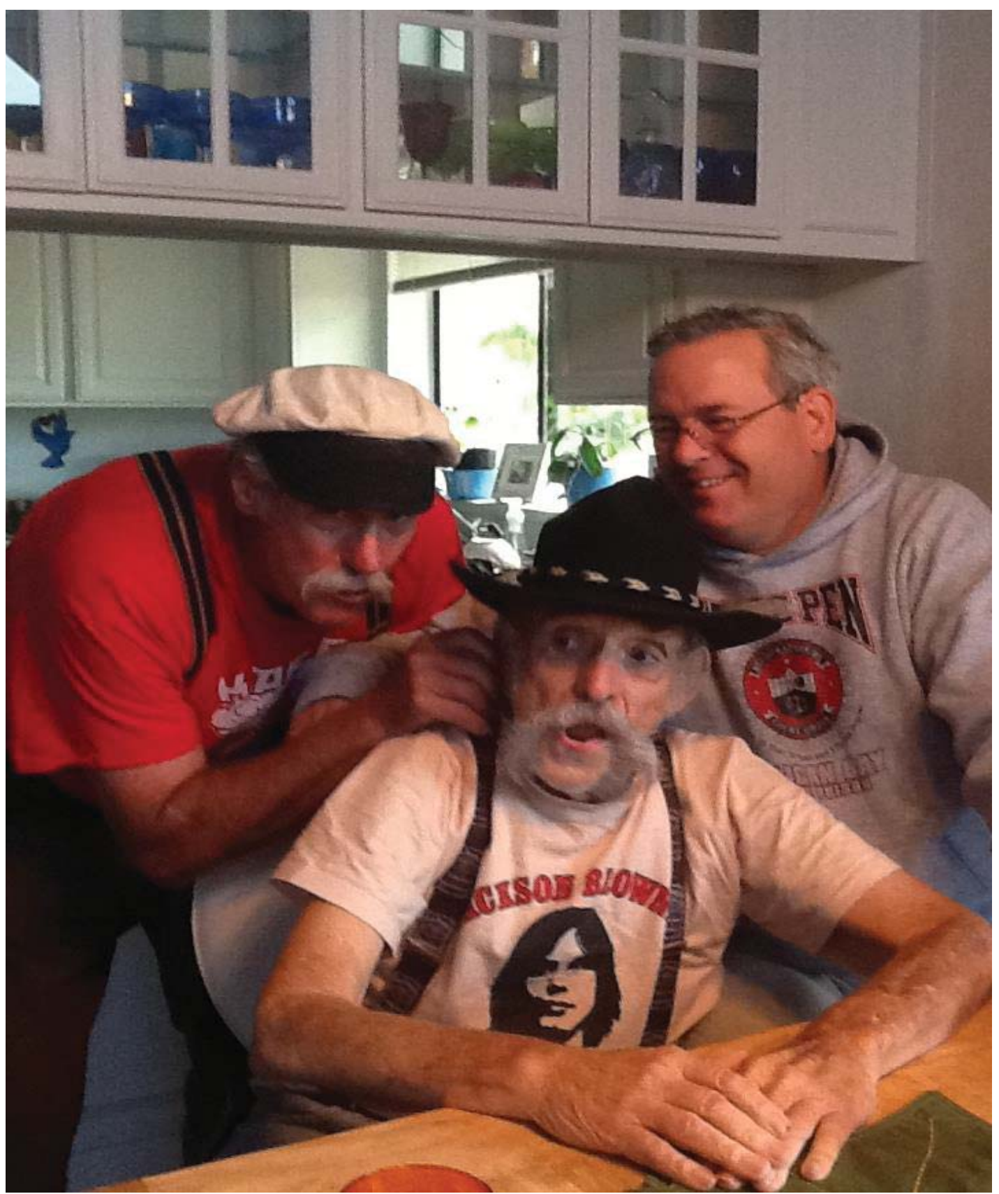
Figure 6: With friends like this......