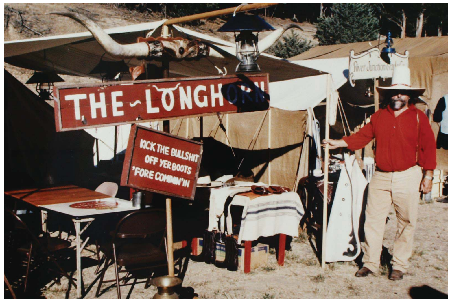
Figure 2: No bullshit at the Longhorn.